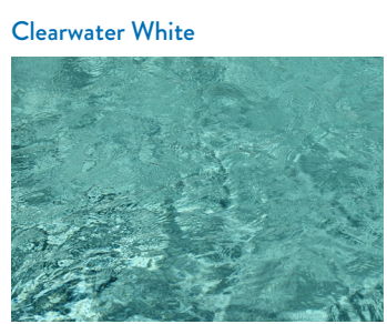
*Color tones and shades can vary slightly due to time of day and depth of pool.